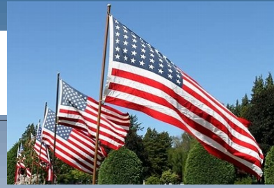
FLAG DAY JUNE 14, 2024